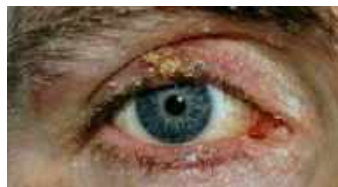
BLEPHARITIS (inflammation of the edge of eyelids)