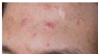
ACNE AND BLACKHEAD