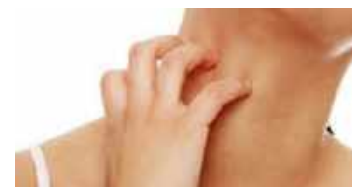
RASH AND ITCHING

All these symptoms indicate a high population density of mite is present and needs to be treated effectively. It requires immediate, aggressive treatment and only with the right product and protocol can Demodex be eliminated.