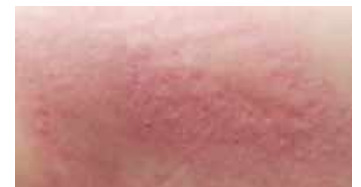
REDNESS AND DISCOLOURATION