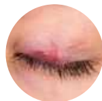
Broken blood vessels on your eyelids