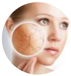
Patches of rough, dry skin

Aside from the redness, the bumps and the possible eye problems (such as redness, swelling and pain), symptoms can include: