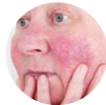
Stinging and burning of your skin