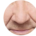
Swollen, bulb-shaped nose