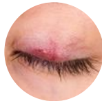
Broken blood vessels on your eyelids