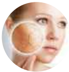
Patches of rough, dry skin

Aside from the redness, the bumps and the possible eye problems (such as redness, swelling and pain), symptoms can include: