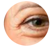
Problems with vision